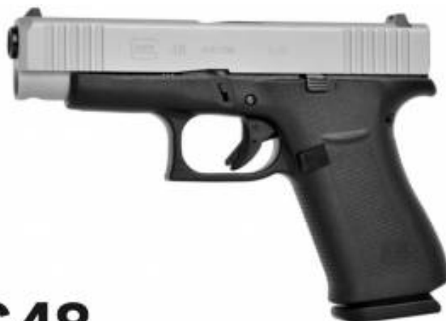
G48 COMPACT | 9x19