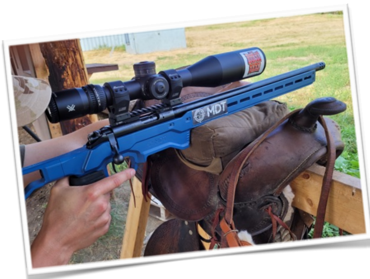
(Loaner Rifle) CZ 455 in MDT chassis and VortexVenom scope from the Horse Barn

See Youtube https://www.youtube.com/watch?v=EYheIVqoVgI for a several videos of the PRS matches held at Heffley Creek Gun Club. We shoot year round and have informal practices on most weekends at HCG