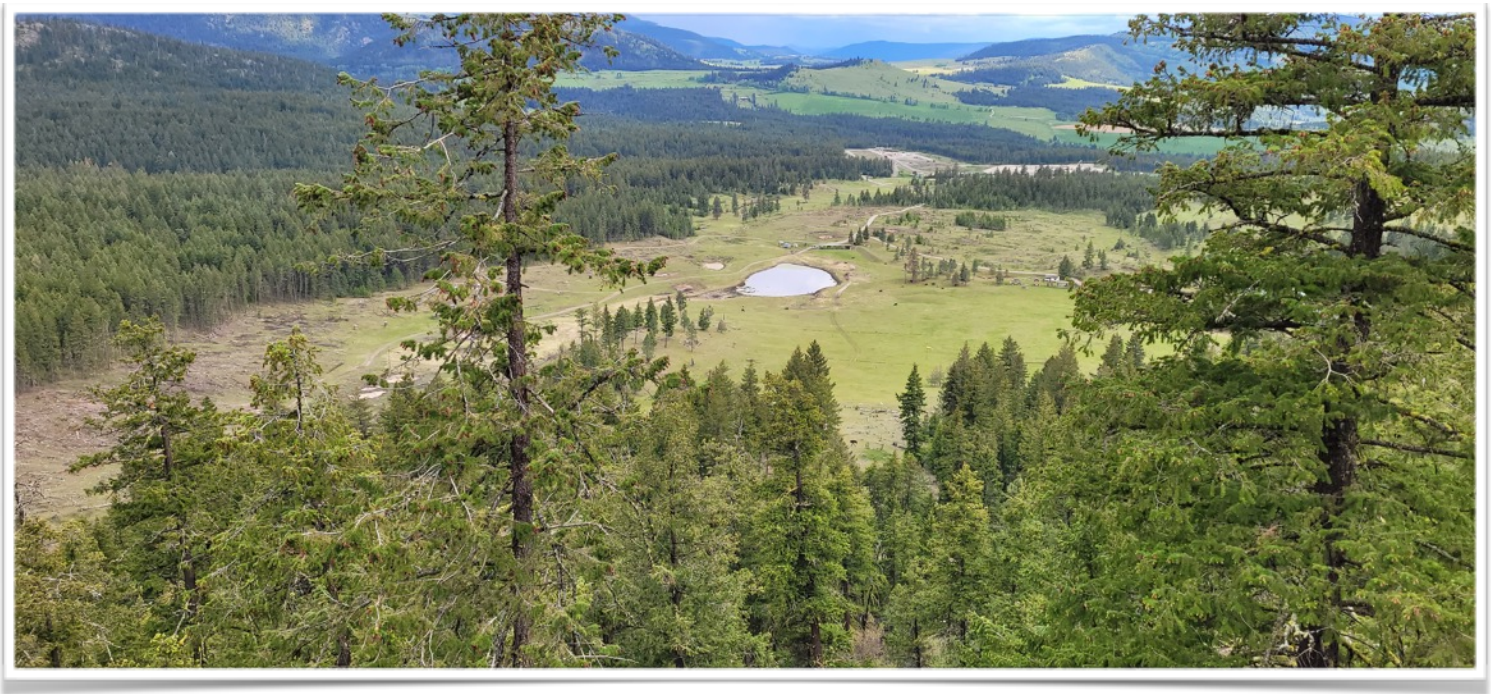
A view of the range looking towards the Rifle Firing Line

Attached are two photos depicting the proposed new 1000 yard range. This proposed rifle range will allow the return of F-class shooting and allow for paper targets to be set up past the current 200 yard backboard.