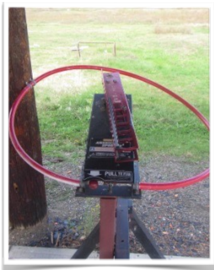
Photo 2 : The trap has been left in a “Cocked” position. This is dangerous as someone walking in front may be struck by the arm or a bird/clay if the trap is inadvertently released.

The following photos show the manual trap located in the pistol shed. Please review and understand the instructions (posted beside the trap) and the following photos before using. Have Fun!